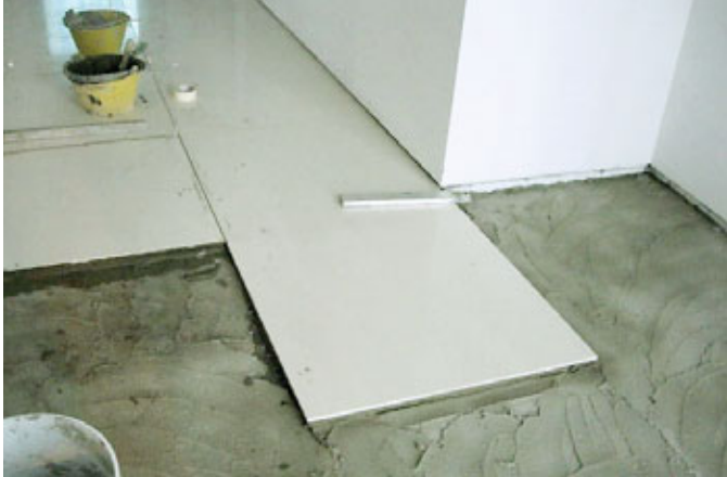
Fig. 5.7 – 1-component adhesive: Add powder + clean potable water.