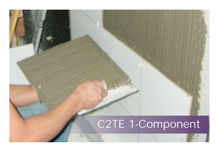
Fig. 5.5 – Tiles with low water absorption on a rendered substrate.

High performance, deformable cementitious adhesive is suitable for tiles and stones which are less prone to moisture absorption. The bedding thickness can range from 3 mm to 10 mm for thin-bed adhesives or up to 15 mm for medium bed adhesives. As the polymers are integrated into the mortar, it does not require separate latex liquid for mixing other than water.