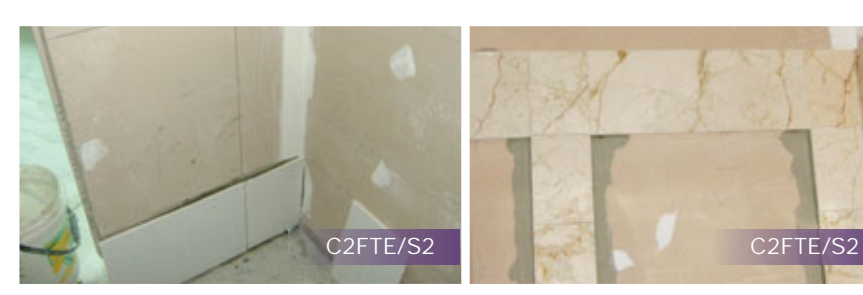
Fig. 5.3 – Installation of tiles and stones on partition board substrate.

The downward movement on a vertical surface is generally high in deformable substrates such as plywood or board partitions. These substrates require the adhesive to be fast setting, deformable and slip resistant for better performance.