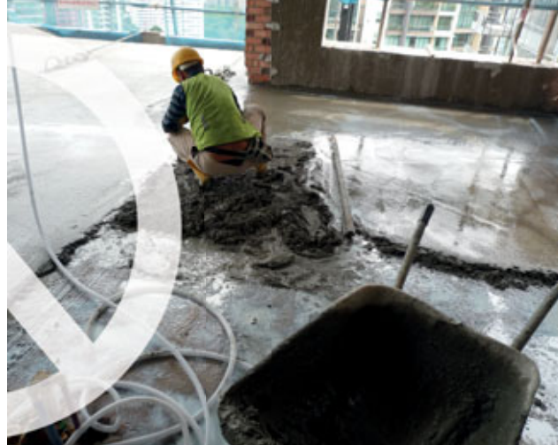
Fig. 5.9 – A typical conventional floor screeding process using cement-sand mortar.

To avoid the inconvenience of prolonged curing, a medium-bed mortar can be considered. Instead of laying a cement-sand screed, the adhesive up to 15 mm thick can be laid directly onto the concrete substrate followed by the tile. However, the substrate should be reasonably level with good surface preparation, otherwise excessive thick-bed mortar may be required to correct the differences in levels, leading to additional time and cost.