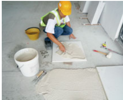
Fig. 5.10 – Screed-less bedding adhesive for laying marble floor.