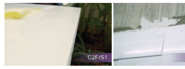
Fig. 5.2 – Porous natural stones with a substrate of cement render or concrete.

High performance fast-setting with early tensile strength and deformable adhesive is compatible for installation of stones which are prone to moisture ingress and requires rapid drying. Because of its improved bonding strength and fast setting properties, it is also suitable for floors which are subject to heavy traffic and places that require rapid re-flooring or retrofitting such as supermarkets, hospitals, airports, etc. The use of epoxy material (R type adhesive) is an alternative choice for moisture sensitive tiles or stones. However the cost of epoxy based adhesive is often higher than cementitious adhesives.